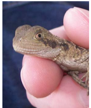
Jacky Lizard – cat attack