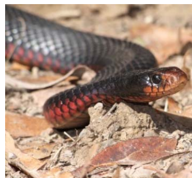
Red Bellied Black Snake (venomous)