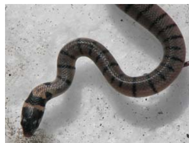
Juvenile Brown Snake (Venomous)