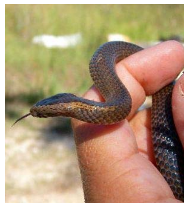
Golden Crowned Snake

Golden Crowned Snake 40 cms – has a gold crown pattern on its head and is a dark brown colour.