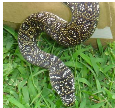
Diamond Python (non-venomous)