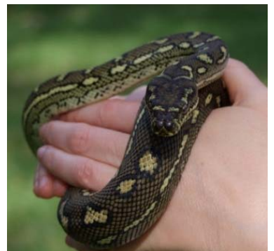
Carpet Python – escaped pet