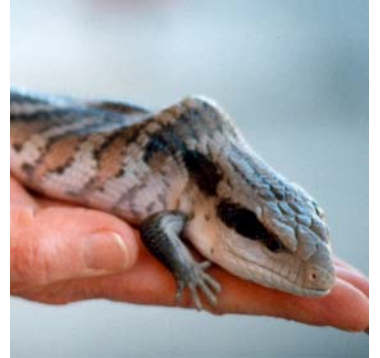
Blue tongue Lizard – dog attack

If you have a snake in your garden – keep your dogs and children indoors and keep an eye on the snake to see if it leaves your area. Keep a safe distance away from the snake and watch where it goes.