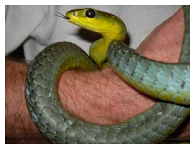
Green Tree Snake (non-venomous)