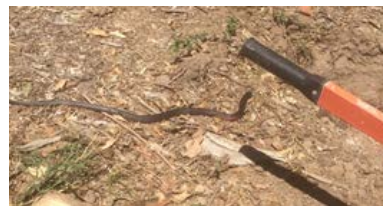
Below: 4. Our resident Red Belly Black Snake taking a keen interest in the construction.