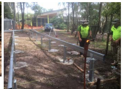
2. Laying the metal bearers & joists