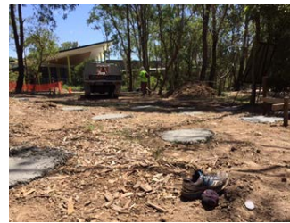
Above: 1. First the Footings